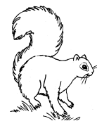
a furry friend