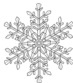
snow or ice