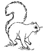
a furry friend